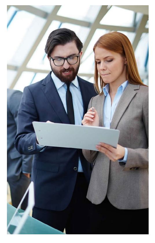
— Ok, thank you, I see your point. What resources can we allocate for attraction?

— A very good question. The main thing I would advise you is that you should not get too enthusiastic about loans, as young people remain one of the most risky segments. Of course, you remember our technological limitations: the bank is rebuilding its technological infrastructure and cannot afford to invest resources in new directions. Figuratively speaking, we can update a mobile application, but we cannot develop an Internet banking system from the very beginning. I think you should definitely study examples of international practices. Foreign banks paid attention to this direction a long time ago; it would be interesting to study their practices and see how suitable they are for Russia.